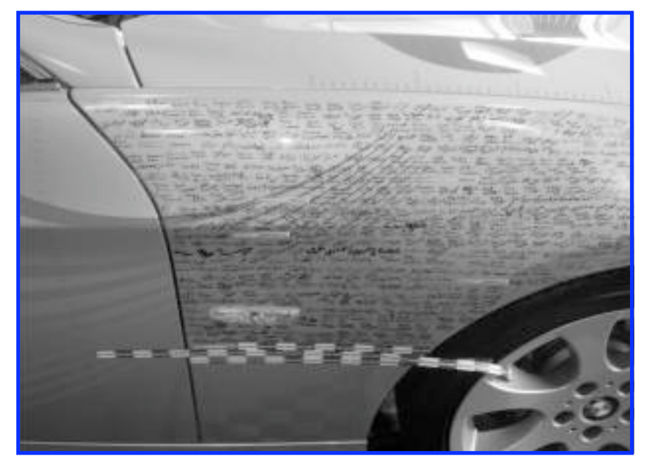
FIGURE 1. BMW signed car in North Carolina.

same stretch of freeway on which my car had been totaled by a semi the previous month—but at least I was Earning-A-Dollar-A-Mile-For-Breast-Cancer).