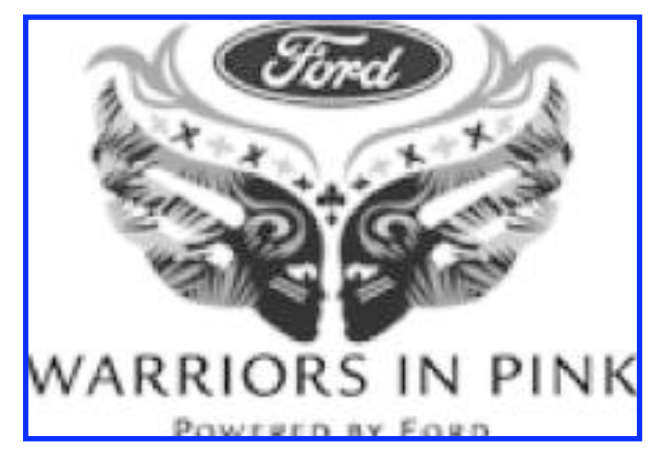
FIGURE 2. "Ford Vehicles: Ford Cares" (Ford Vehicles 2007).

find out how much money these campaigns collect, it is nearly impossible to figure out where that money goes. Nevertheless, BMW has raised $9 million through this campaign, and I was able to drive the car I have always fetishized.<sup>1</sup>